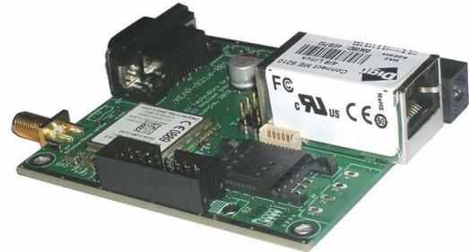
XEAP: eXtensible Embedded Access Platform